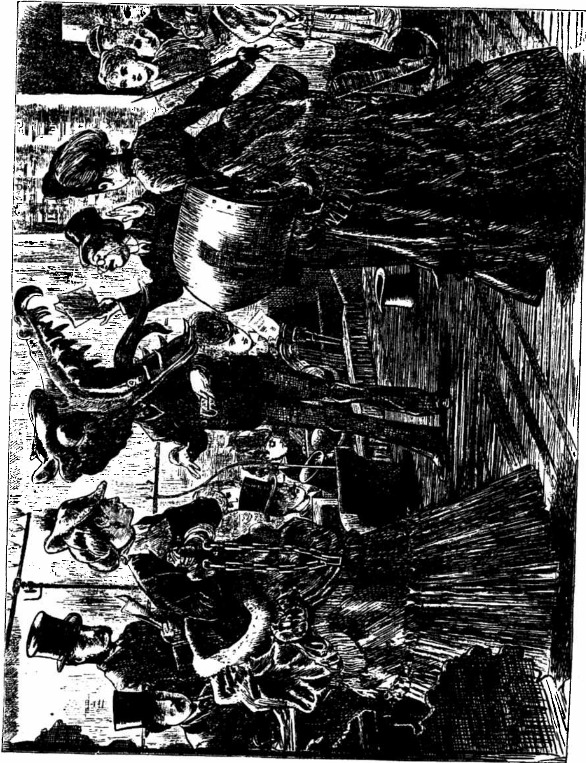
THE NEW BURLESQUE—AN UNDRESS REHEARSAL